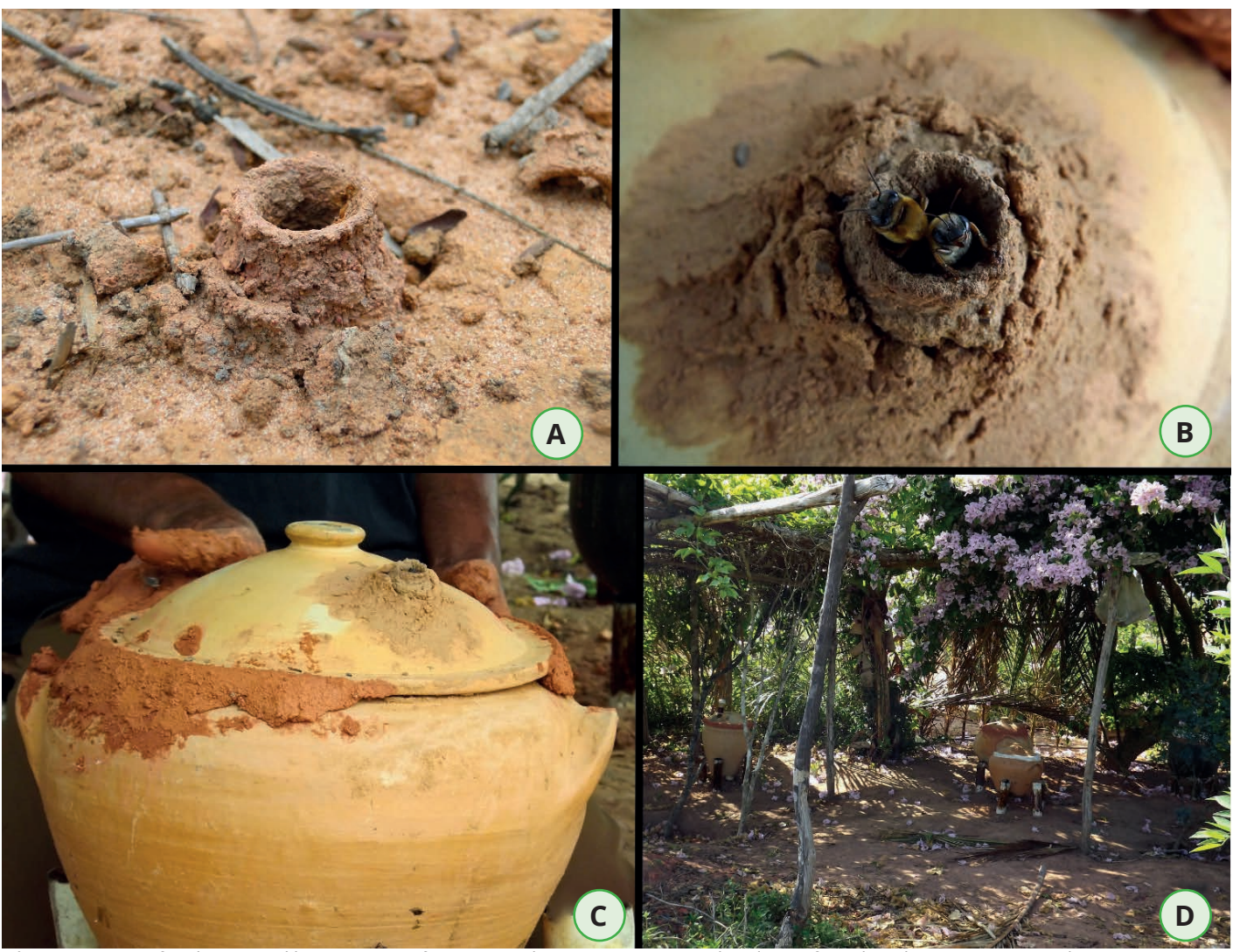
Figure 4. Nests of Melipona ( Melikerria ) quinquefasciata Lepeletier, 1836 excavated and transferred to clay pots. A. Natural nest entrance; B. Nest entrance in clay pot; C. Clay pot that the nest was recently transferred; D. Environment in which the nests recently transferred to clay pots, were exposed.