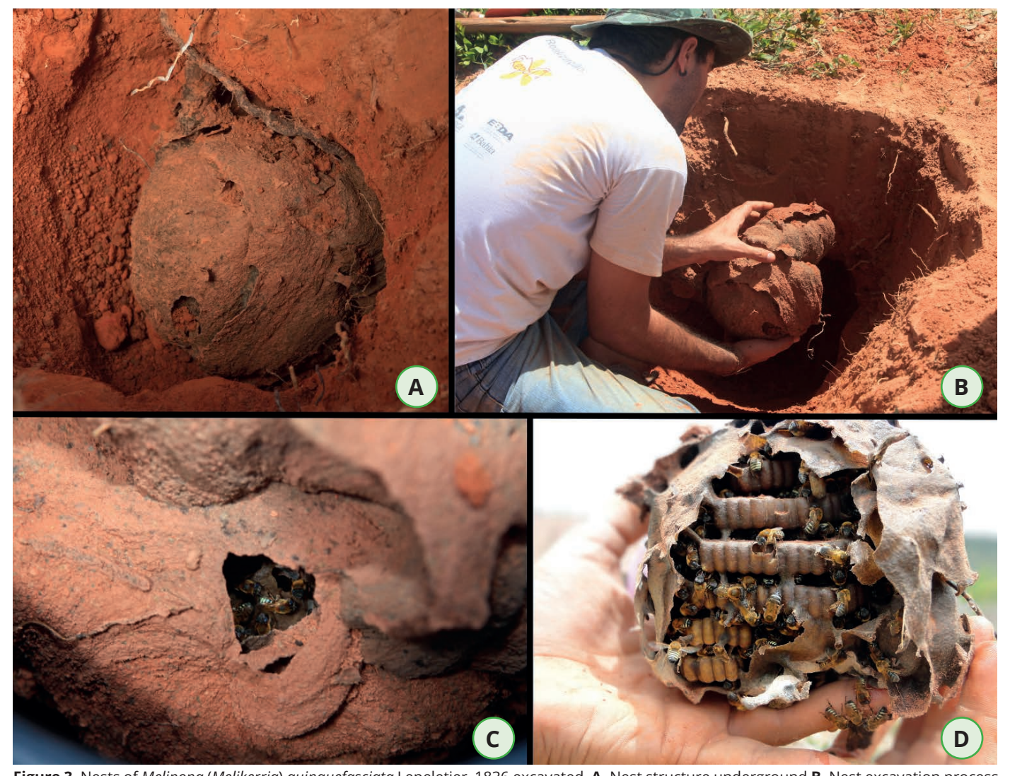
Figure 3. Nests of Melipona ( Melikerria ) quinquefasciata Lepeletier, 1836 excavated. A. Nest structure underground B. Nest excavation process C. Bees in indoor activity in the nest D. Brood discs and internal nest structure.