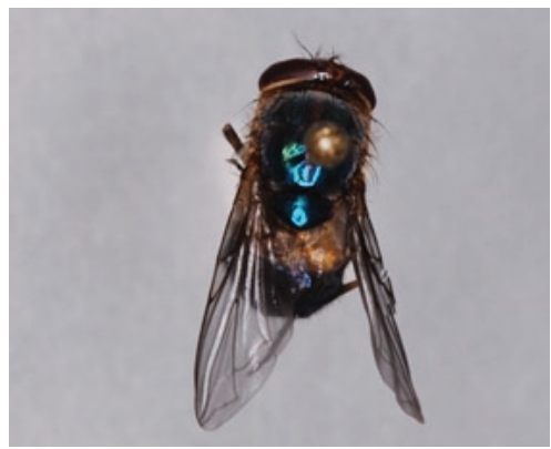
Figure 4. Adult of Hemilucilia segmentaria collected as a third instar larva on July 24th, 2012 and reared at LESUF-INPA.