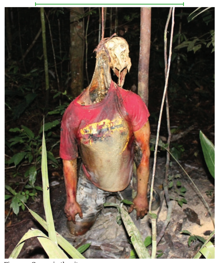
Figure 2. Corpse in the site.