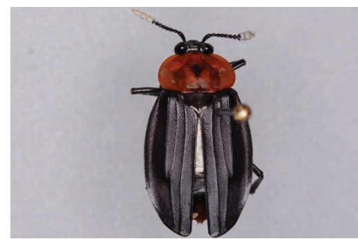
Figure 3. Adult of Oxelytrum cayennense collected on July 24th, 2012.