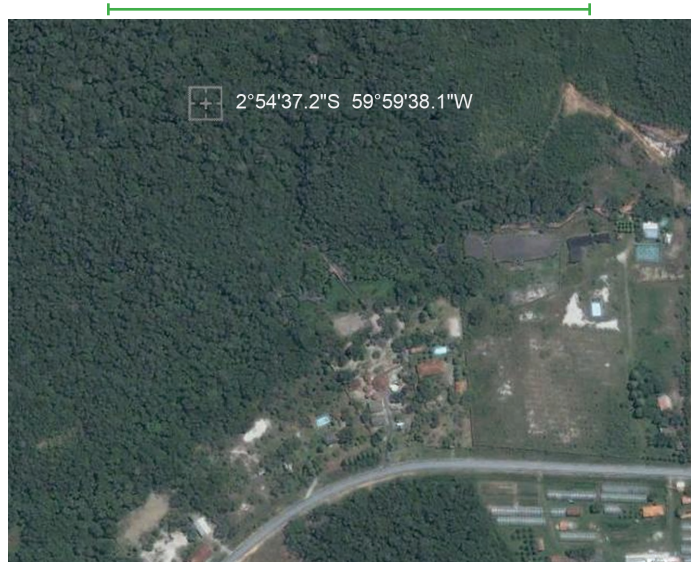
Figure 1. Satellite view of the site with plotted coordinates (Google Maps-12/08/2004, 4 1.4Km altitude).

(2009). All insects were deposited as vouchers in the Invertebrate Collection of INPA.