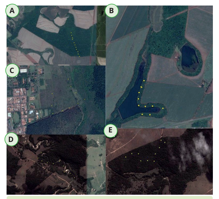
Figure 1. Distribution map of the collection areas in the São Paulo State and the sampled spots in each phytophysiognomy. The yellow marking represents the distance between sampling points (100 m) and where each trap was set.

The bait-trap distribution was done by the following procedure: ten points, distanced 100 m from each other, were marked using plastic tape tied to trees, thus reducing the chance of pseudoreplication by collection of a single wasp population in different sampling unities. At each point, five traps with a height of 1.5 m from ground and five other traps at canopy level (around 5-9 m) were set. The traps were made with 2 L plastic bottles (Souza et al. 2015). At each bottle, four circular holes were done and 200 ml of concentrated passion fruit juice were added to be used as bait. The specimens were collected with a sieve and tweezers and fixed in 70% alcohol recipients of the universal collector type.